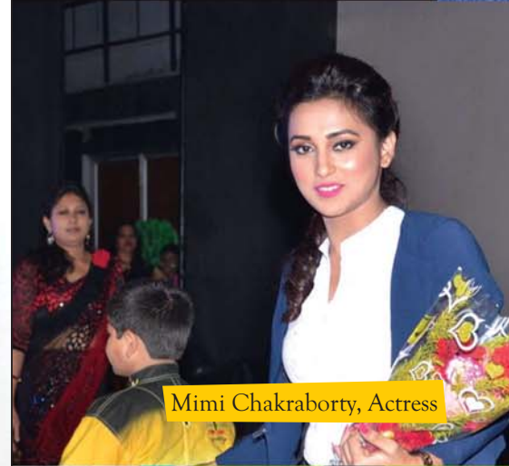
Mimi Chakraborty, Actress