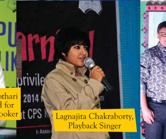
Lagnajita Chakraborty, Playback Singer