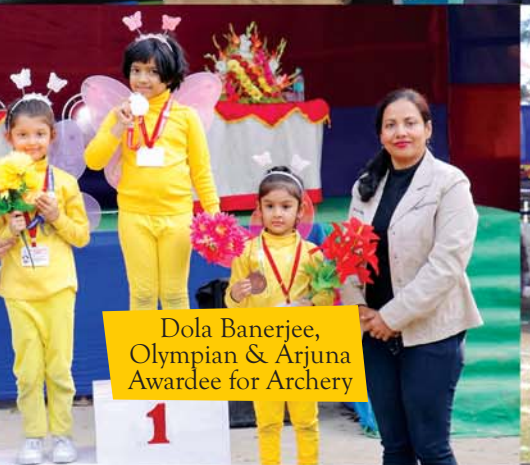
Dola Banerjee, Olympian & Arjuna Awardee for Archery