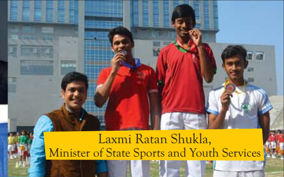
Laxmi Ratan Shukla, Minister of State Sports and Youth Services