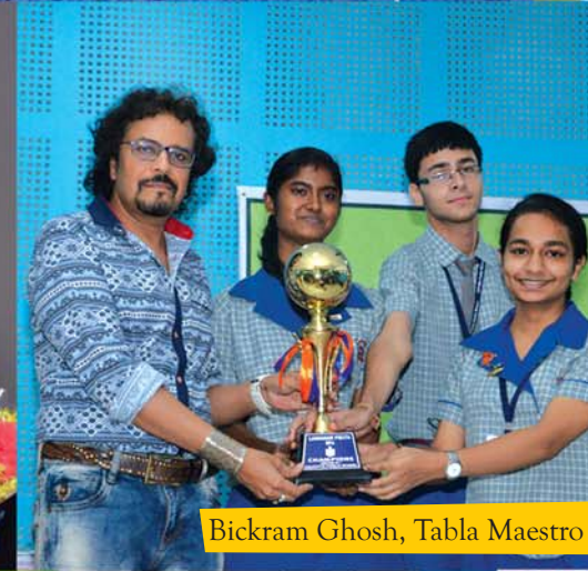
Bickram Ghosh, Tabla Maestro