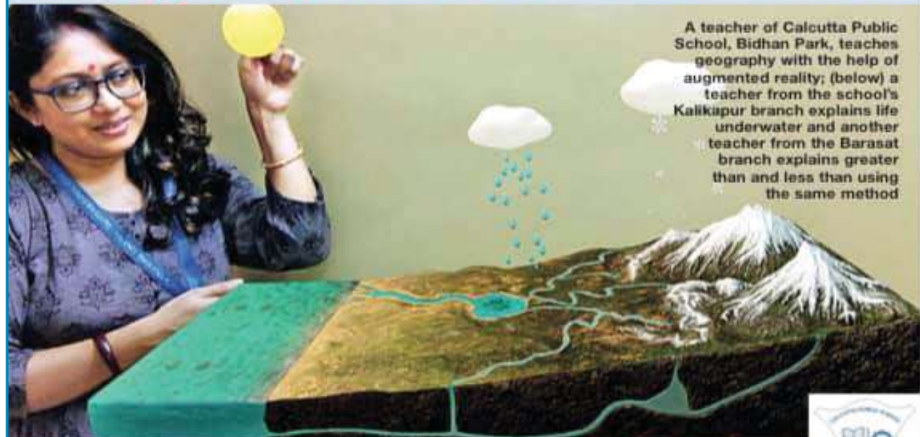
A teacher of Calcutta Public School, Bidhan Park, teaches geography with the help of augmented reality; (below) a teacher from the school's Kalikapur branch explains life underwater and another teacher from the Barasat branch explains greater than and less than using the same method

Tough situations do not last, tough people do – as if to test the truth in this saying, COVID-19 came knocking at the doors. It changed the way we looked at life. The pandemic and its ripple effect challenged educators across the globe, forcing them to come up with "out of the box" alternatives to regular school teaching and evaluation. The Calcutta Public School Kalikapur, Bidhan Park and Barasat, were among the first schools in Kolkata to switch to the remote learning mode. The management organised workshop and online training programmes to empower the faculty digitally and technologically at record speed. Almost overnight, as soon as students were prohibited from going